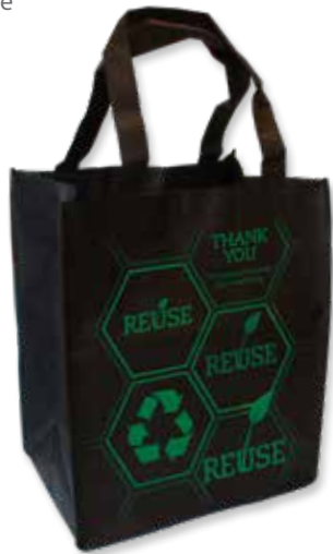
Handle / Black / Non-woven / Reuse Hex