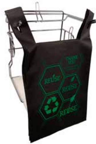
T-shirt / Black / Non-woven / Reuse Hex